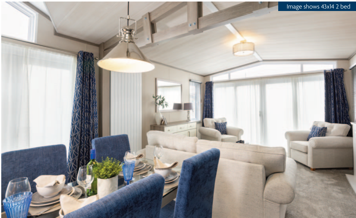
Image shows 43x14 2 bed

The sumptuous sofa provides a separation between the dining area and lounge, however the flow of natural daylight fills the entire scene through the dormer and skylight windows. There's also the option to further augment this airiness by choosing the side bifolding door. Pampering is a pleasure thanks to the thoughtfully designed vanity area which has an elegant backdrop of a feature panelled wall. A variety of beautiful lighting options throughout allows each room to have the perfect ambience.