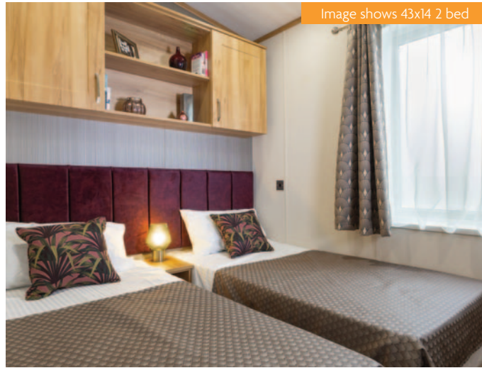
Image shows 43x14 2 bed