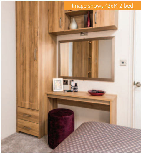
Image shows 43x14 2 bed