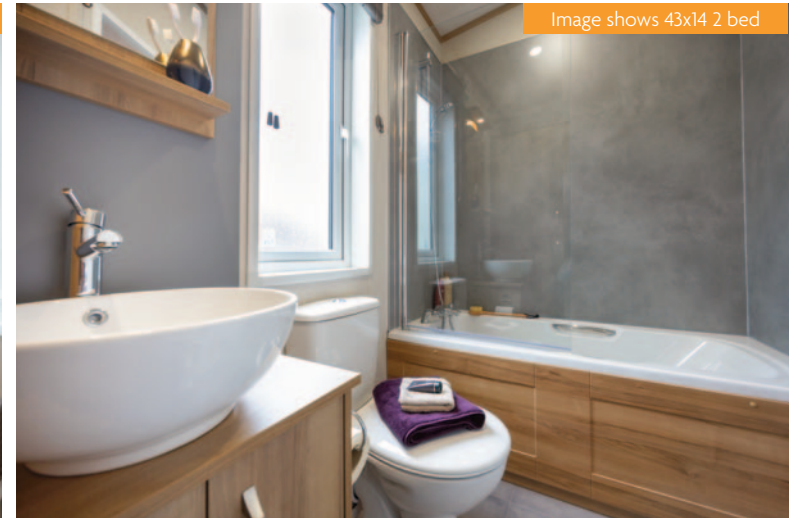
Image shows 43x14 2 bed