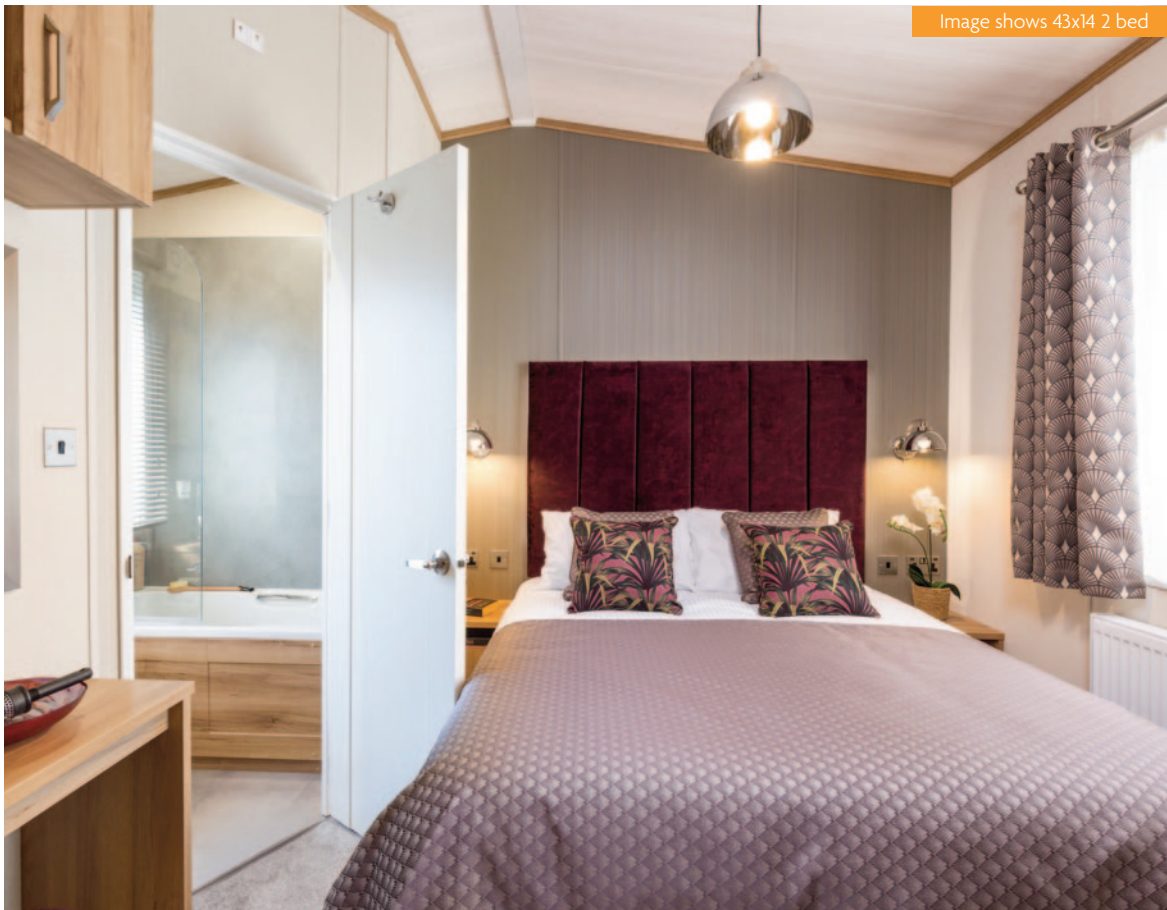
Image shows 43x14 2 bed