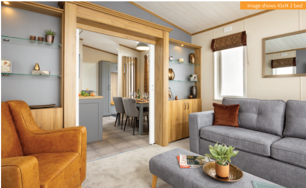
Image shows 43x14 2 bed

A wine cooler is the perfect optional extra to complete an already comprehensive standard kitchen specification of an integrated washer/dryer, fridge/freezer, dishwasher and microwave. This model has 3ft beds to the twin bedroom which can be swapped for a 5 ft bed if required. Plush headboards add a pop of colour to the bedrooms and the lighting throughout is beautiful and well thought-out.