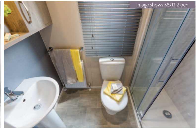
Image shows 38x12 2 bed