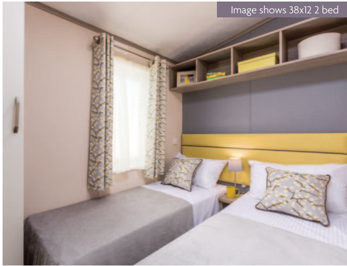
Image shows 38x12 2 bed