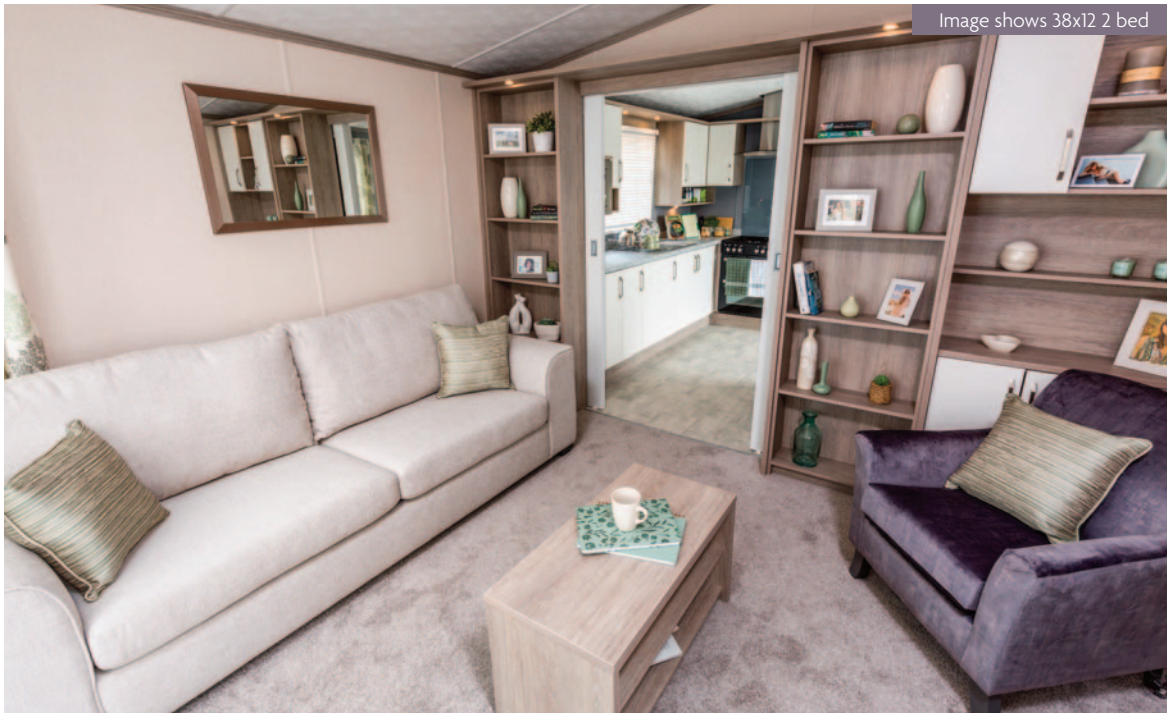
Image shows 38x12 2 bed

An L shaped kitchen allows for vast counter space, perfect for preparing meals or baking. The bedrooms are sleek and uncluttered with functional furniture such as floating bedside tables and a dressing table with room for storage baskets on the shelving unit in the 38ft model. Both Regent models have en-suite toilets and the shower rooms are well appointed with smart fixtures and fittings.