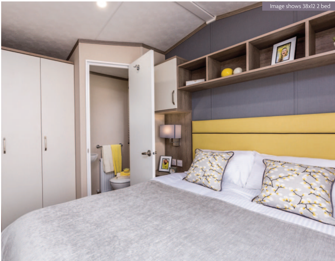
Image shows 38x12 2 bed