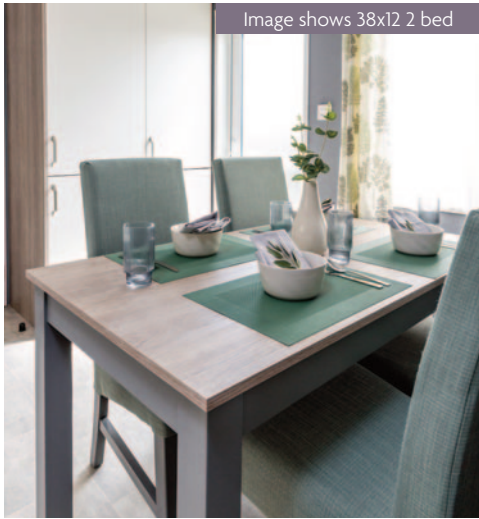
Image shows 38x12 2 bed